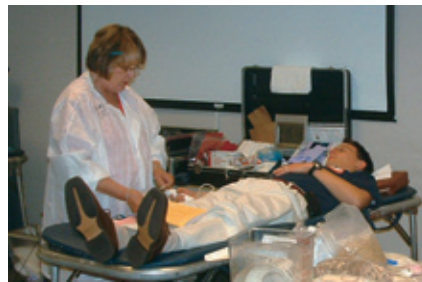
Blood drive at AEC