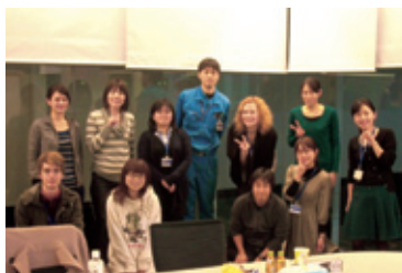
Cross-cultural workshop for young akebono associates and interns (November 9, 2010, at Ai-City headquarters)

akebono is proactively promoting internship with the aim of developing associates' sense of being part of an international concern meeting diverse needs and expanding in global markets as well as of supporting young non-Japanese people's career choices. In fiscal 2011, we aim to assign more than one intern to each Headquarters department. By creating an environment in which interns from various national origins can gather and get involved in programs alongside akebono associates, we will lay the groundwork for global human resources.