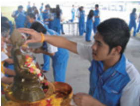
Songkran (Thai traditional New Year's water-throwing festival)

During Songkran, the traditional New Year's celebration in Thailand from April 13 to 15 every year, AKBT holds a purification rite at office. After this ceremony, the celebration turns into a festival where people throw water on each other, and this has become an important event that helps to promote friendship among associates. As for other events to facilitate friendship, AKBT conducts company trips. In fiscal 2010, we made an overnight trip to Nakornnayok. We also hold a New Year's Party and Sports Day before the year-end holiday in December. On that day, we invite a Buddhist monk to purify the plant in the morning, and hold the sports festival in the afternoon. All the AKBT associates participate, breaking into two teams to enjoy games.