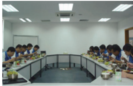
Twice monthly birthday gathering

Twice a month, Akebono Corporation (Guangzhou) holds gatherings of senior staff and associates whose birthdays fall in those months. Senior staff hear associate suggestions and opinions during the luncheon that they reflect in their business management. In addition, we hold an annual company trip with all associates to facilitate communication among associates while raising their motivation. On the safety front, we conduct emergency drills and, in tandem with Akebono Corporation (Suzhou), offer opportunities for mutual exchange and engage in improvement activities regarding safety and health. As a result of our efforts, Akebono Corporation (Guangzhou) achieved 1,000 no-disaster days.