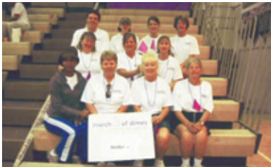
Associates participating in the infant health campaign

Every year, ABE and ABC associates participate in the March of Dimes Walk-a-Thon to raise money for research and education aimed at improving infant health by helping to prevent birth defects, premature birth and infant mortality. March of Dimes researchers, volunteers, educators, outreach workers and advocates work together to give all babies a fighting chance in an often threatening world.