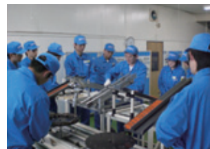
New recruits at the Basic Training Class

In fiscal 2010, we also began taking the initiative in globalization. Starting with the plant managers of ABCT and the Akebono Brake Columbia Plant (ABCS) in the United States, we accepted a total of 41 trainees from overseas. akebono is now facing its third phase of transition and the Monozukuri Center is playing a crucial role in spreading the benefit of akebono's monozukuri as well as the benefit of Japan's monozukuri to overseas bases.