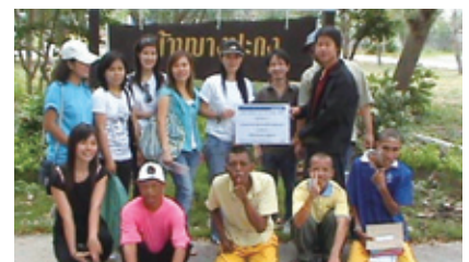
AKBT associates and facility residents

As part of its volunteer activities in local communities, Akebono Brake (Thailand) Co., Ltd. (AKBT) periodically visits a facility for handicapped people with gifts purchased with funds raised by employees. The facility maintains a craft studio where the physically handicapped make accessories for sale. Despite the differences in the way we make products, we are both involved in "manufacturing." Communications are thus enlivened by the exchange of opinions as well as anecdotes about challenging and rewarding experiences.