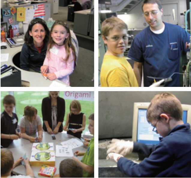
Bring Your Kids to Work Day (April 28, 2011)

AEC holds events in which associates' children can experience what it is like to be an AEC associate. Associates come to work with their children in the morning and spend the whole day showing them around the office and plant facilities, even giving them the opportunity to perform some tasks themselves. This deepens children's understanding of their parents' work, while helping boost associate motivation.