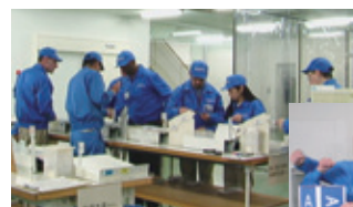
Training seminar for overseas trainees

In February 2011, we welcomed seven trainees from ABCT and ABCS in the United States. We held training mainly at the APS Dojo and Quality Dojo, and received such feedback from trainees as "I would like to bring back what I learned here to our plant in the States and reflect it to our operational improvement."