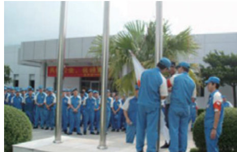
A ceremony to hoist a safety flag in commemoration of achieving 1,000 no-disaster days