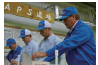
ABCT and ABCS Plant managers taking a training course