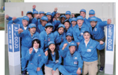
Trainees and Monozukuri Center staff